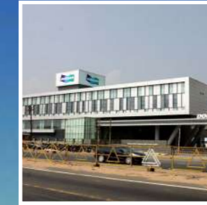
Doosan Chennai, India