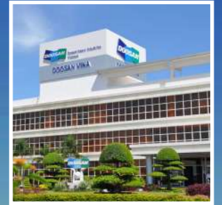
Doosan Vina, Vietnam