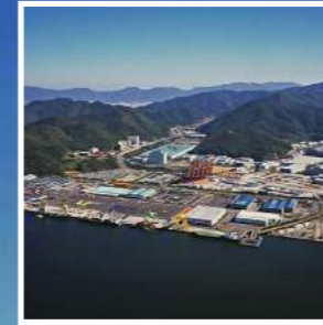
Doosan Headquarter, Changwon, Korea